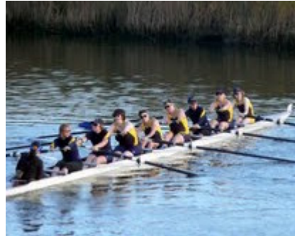
Kenai Crewsers Rowing Club at Petaluma, CA